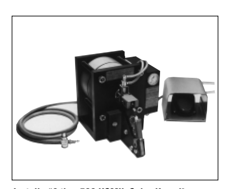
Installs #8 thru 500 KCMIL Color-Keyed® copper lugs, splices and taps and #10 thru 350 KCMIL Color-Keyed® aluminum lugs and splices and 63105 through 63140 orange, green and blue "H" tans.